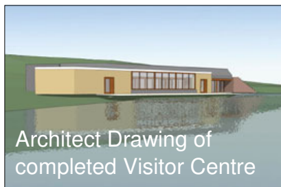
Architect Drawing of completed Visitor Centre

Hopefully most of you got a chance to see the Village SOS BBC1 programme all about Newstead Village and the development of the Country Park. The film showed all the hard work that has gone into this project and really highlighted how much volunteer help we have had from all aspects of the community. Well done to everyone involved!